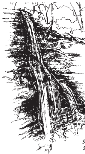
Smith Falls State Park

The next access site is at Berry Bridge , which can be reached from Nebraska 12, or by driving through the refuge. This is a